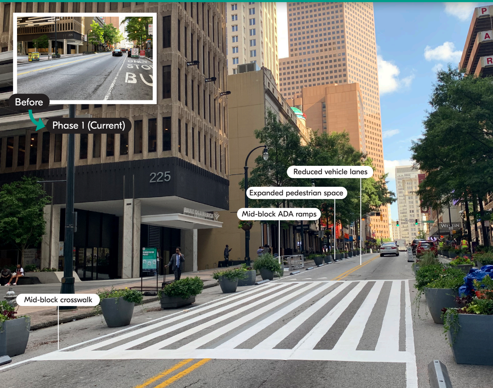
Phase 1 (Current)